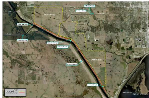
LKBSTA Proposed Development Area

ESA was retained to provide an independent review of a proposed project identified as the Lower Kissimmee Basin Stormwater Treatment Area (LKBSTA) in Okeechobee County. The project includes the development of a regional STA which entails creation of several interconnected herbaceous freshwater wetlands designed to reduce nutrients, specifically phosphorus, from stormwater runoff and help achieve the State of Florida's Total Phosphorus Total Maximum Daily Load for Lake Okeechobee. It is understood that the proposed project will be constructed in two phases with the western phase (LKBSTA-W) being constructed first.